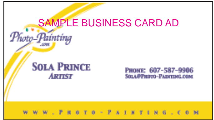
business sponsor card ad