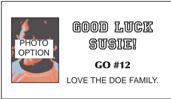
family sponsor card ad with photo